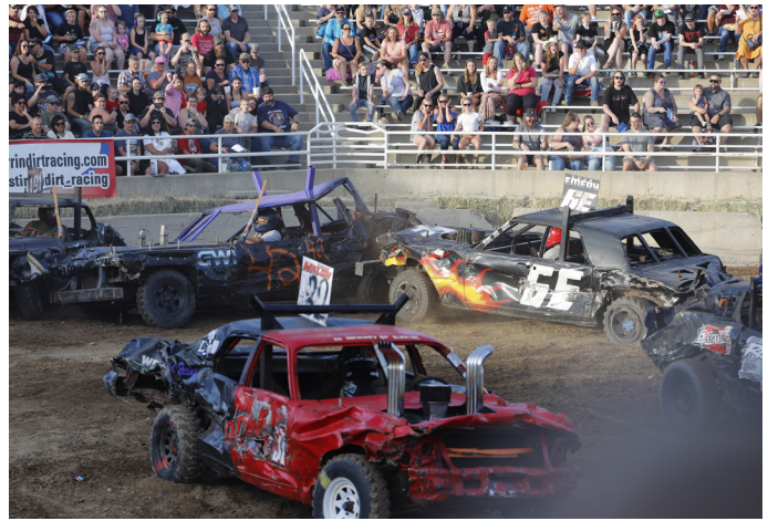
DEMOLITION DERBY 7 p.m. | Outdoor Stadium