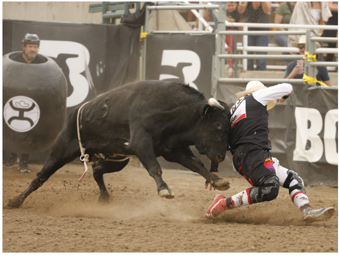
BULLFIGHTS 7 p.m. | Outdoor Stadium