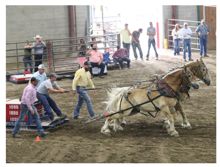
HORSE PULLS 6 p.m. | Riding Arena