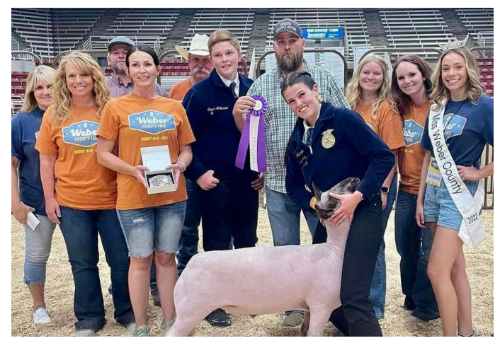
JR. LIVESTOCK AUCTION 9 a.m. | Golden Spike Arena