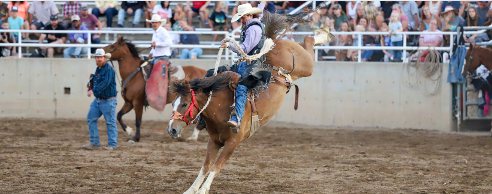
RODEO 7PM | Outdoor Stadium

$2 admission with a nonperishable food donation to Catholic Community Services